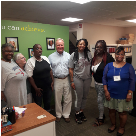
U.S. Rep. Dave Joyce, center, visited Seeds West in October.